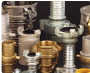
Couplings & Accessories