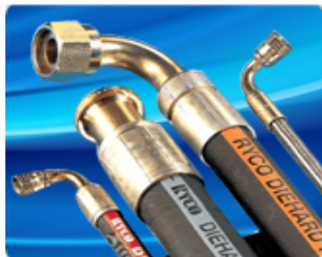
Hydraulic Hose & Fittings